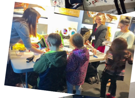
Hands-On Experiences with Students