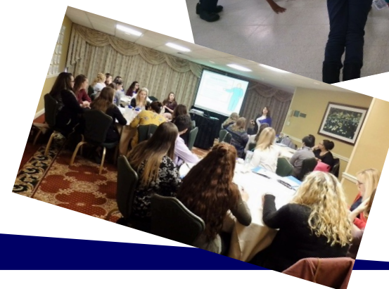
Trainings and Workshops, such as Classroom Management