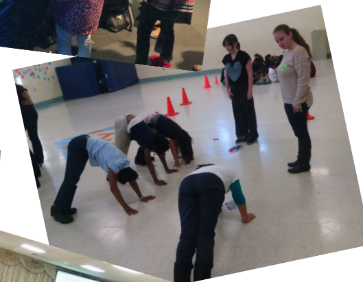
Elementary Academic Field Day