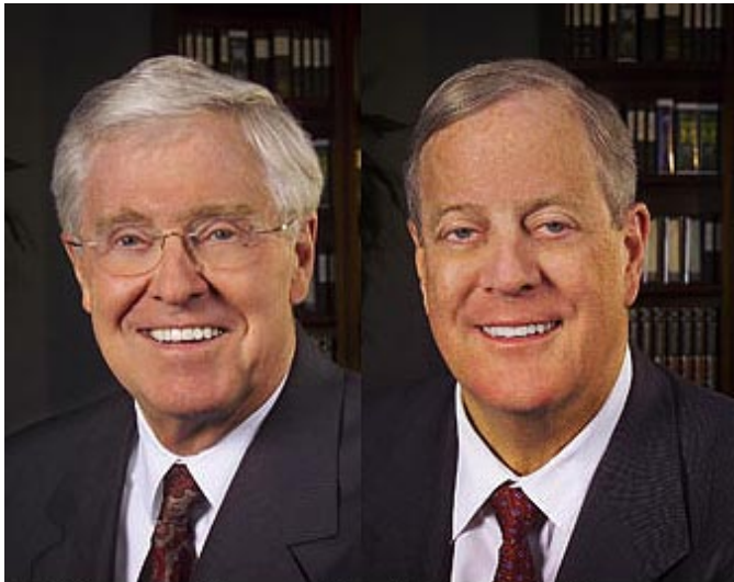
The Koch Brothers Charles and David